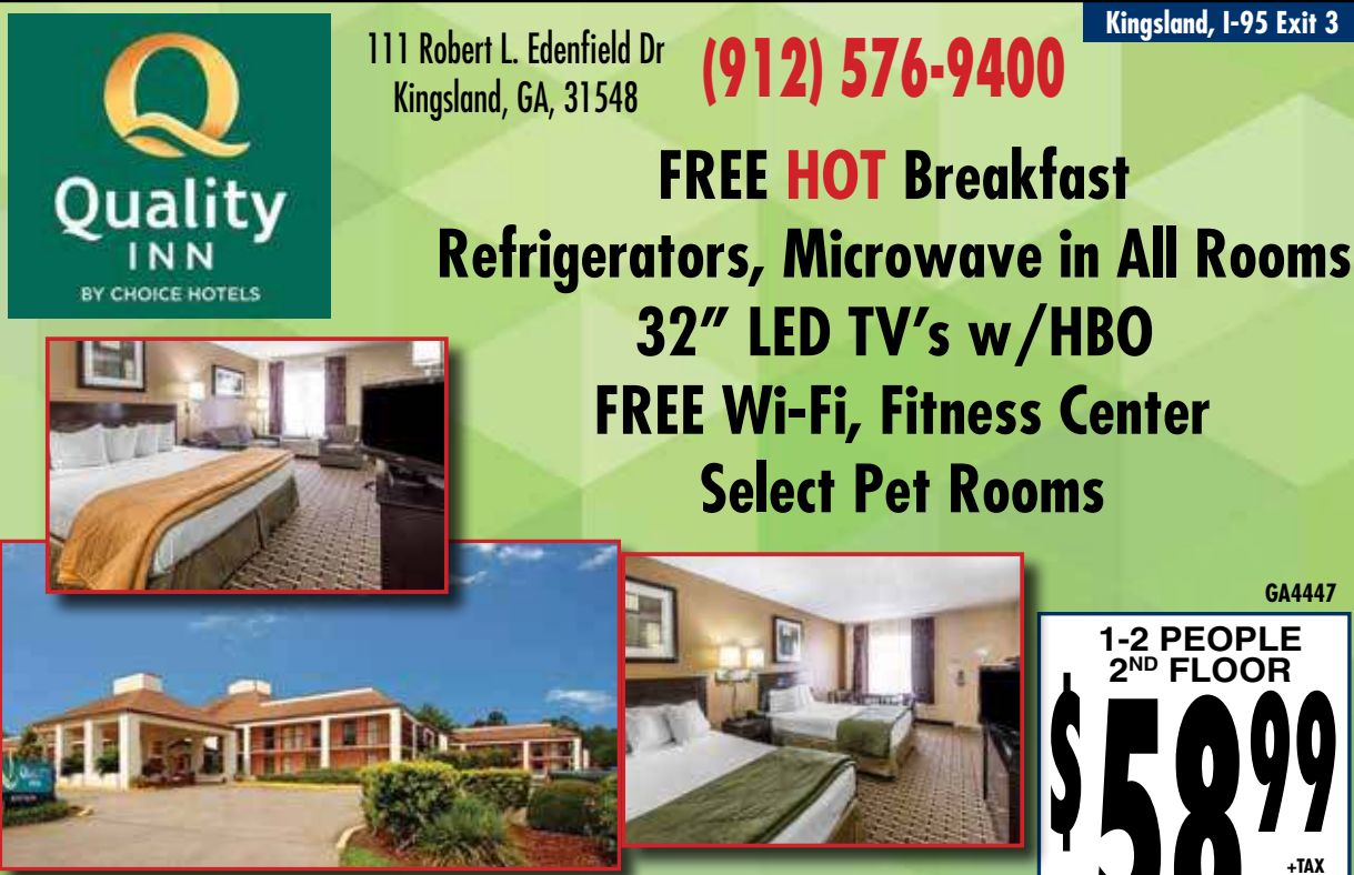
Directions: 1-95 ex. 3 (SR 40), cross RR tracks at traffic lights to Subway and Mobile gas station.